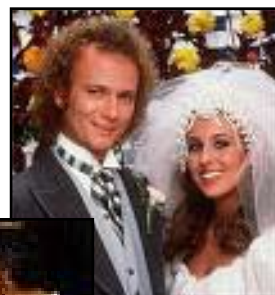
Wedding of the Century?!

Gals, you don't need tri-colored hair or a nose ring, just check the back of your closet for that dress or suit with huge shoulder pads and a wrestling-arena size belt. Underscore the look by donning sneakers for the power-walk to work. Apres-work is time for working out, and the look is leotards, off the shoulder sweaters, and leg warmers. Don't forget: Side Ponytails, Big Hair, and Big Hair Accessories; guys too have: More Big Hair, Afros, and Rock that Mullet. Accessorize with Hammer Time balloon pants, or Miami Vice sandals, tees, sports jackets and faux puka shell necklaces. View 1980 film faves, then cop a look from Pretty Woman, Rocky Horror Picture Show, Star Wars, Cocoon, Ghostbusters, or Flashdance. What a Feeling!