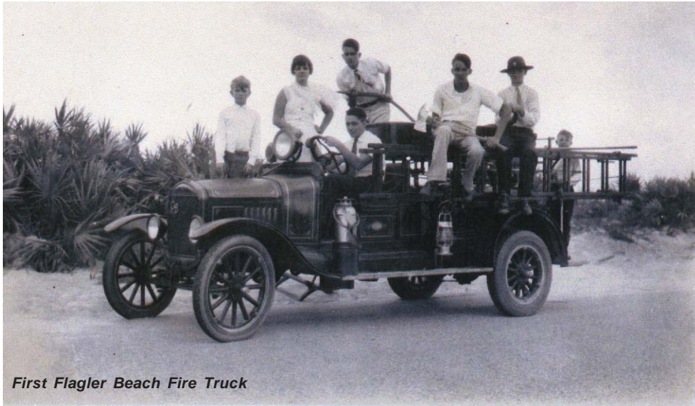
First Flagler Beach Fire Truck

In February of 1928 the Town was once again negotiating with the Boyer Fire Apparatus Company concerning payments due on the fire truck. After the company refused to take the truck back