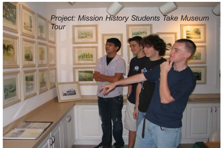
Project: Mission History Students Take Museum Tour

Now there are new reasons to visit the Museum as we've recently partnered with the Flagler Beach Chamber of Commerce to become the city's Visitor Center. If you are looking for fun ways to spend your leisure time, stop by the Museum and pick up brochures about the area's state parks and other attractions. (Note: Chamber administrative functions are served at their office in Helm Financial - Suite 101 at 300 South Central Avenue or by calling 439-0995.) Come in to the Museum yourself or send your guests when they arrive to visit. The Museum and Visitor Center will be open Tuesday through Friday 10a.m. to 4p.m. and Saturdays from noon to 3p.m.